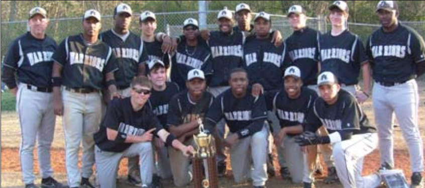
Congratulations to the Warrior baseball team for winning the 2008 Atlanta Public Schools tournament!! They finished the season strong with a 19 - 6 record.