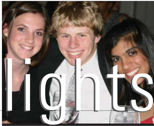
The Red Hot Jazz fundraising event was enjoyed by both students and parents.