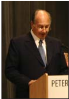
The Aga Khan speaks at North Atlanta.