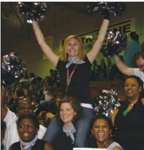
Teachers cheered at the Faculty/student basketball game benefitting the March of Dimes.

NON-PROFIT ORGANIZATION U.S. Postage PAID Atlanta, GA Permit #923