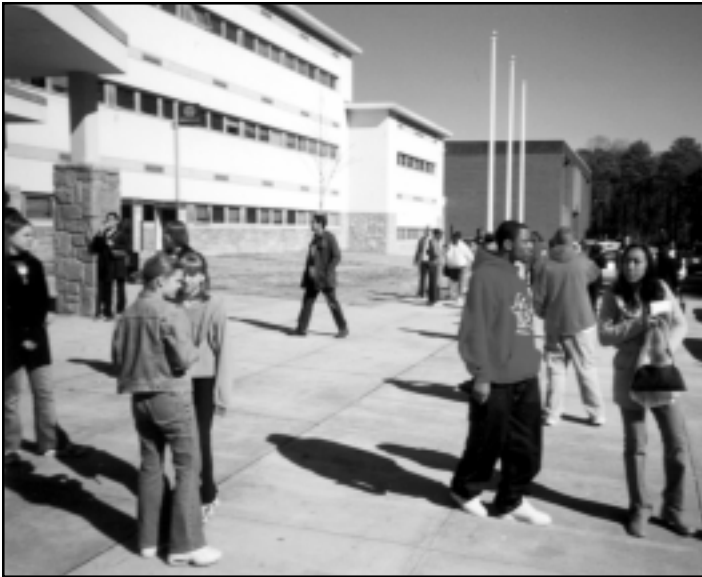
Students emerge after finishing the SAT on Saturday, Jan. 28.