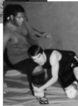
NAHS students are gearing up for winter sports