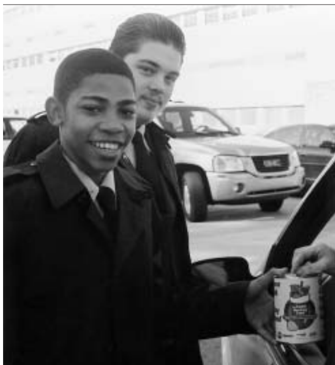
ROTC collecting for the Empty Stocking Fund for the Holidays