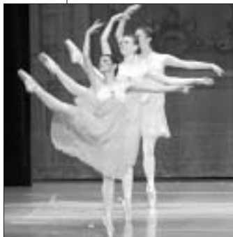
Florida Dance Theatre

The public is cordially invited to join us for the evening performance in the Robert Shaw Theatre. Tickets are available at the door: $10.00 for adults, $5.00 for students.