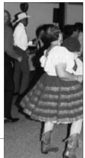
"Goldens" had a ball at the Key Club Valentine party.