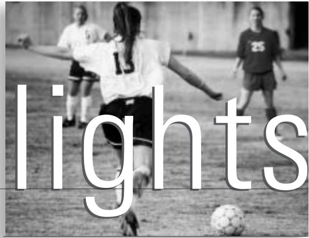
North Atlanta's girls soccer team got off to a running start on the season.

2875 Northside Drive, NW • Atlanta, Georgia 404.351.0895 • www.northatlantahigh.org