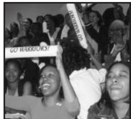
Juniors rally for the GHSGT.