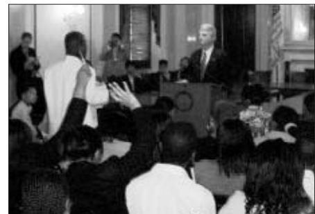
Participants question Sen. Zell Miller.